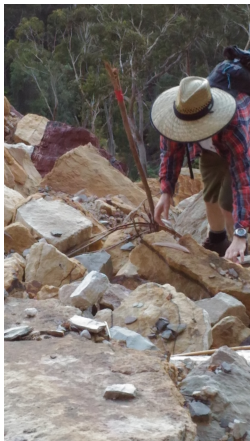
Marking Route - Colosseum Landslide1